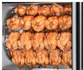
Large product view